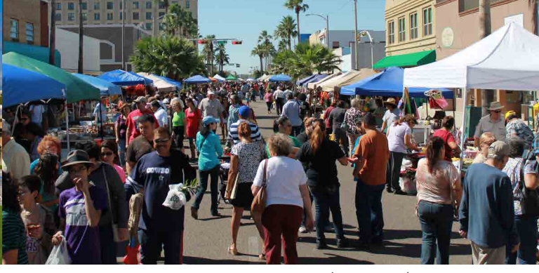
Downtown Harlingen Market Days