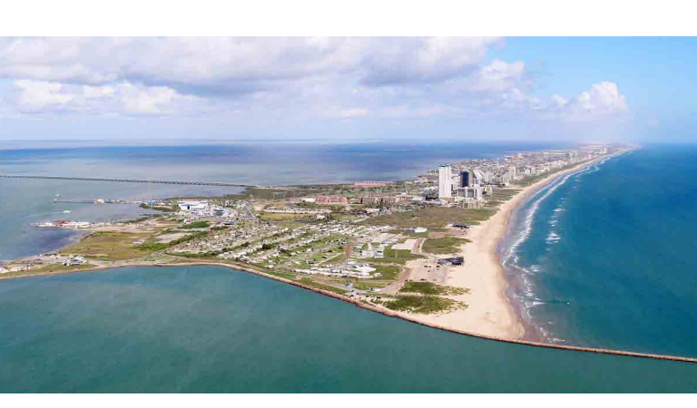
South Padre Island, Texas

Our palms, parrots and picture-perfect tropical weather welcome visitors to a fun-filled getaway. Enjoy 365 days of golf and fabulous bird watching. Go shopping at Bass Pro Shops Outdoor World or in Jackson Street's antique district. Visit the original Iwo Jima Memorial and the World Birding Center home to Green Jays, Great Kiskadees, and chattering chachalacas.