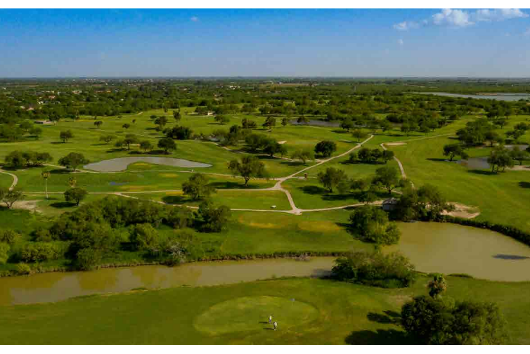
Tony Bulter Golf Course

The Rio Grande Valley has more playable days of golf per year than anywhere else in the United States. With four public courses and one private course, Harlingen has a course for you, whether you're a beginner or a pro.