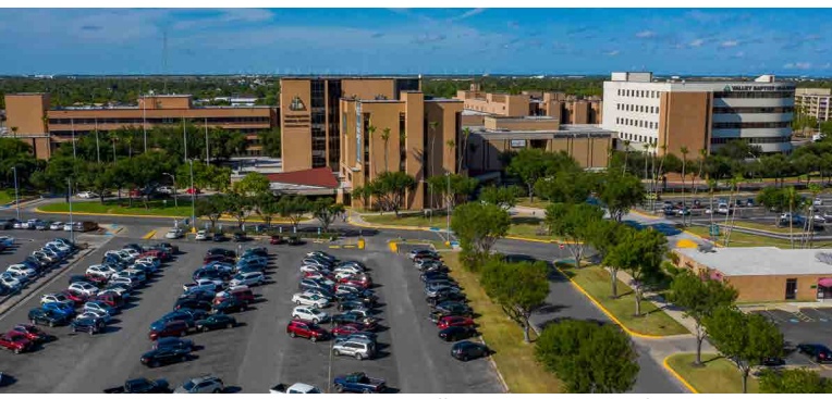
Valley Baptist Medical Center

Valley Baptist Medical Center, with 586 beds and its caring, dedicated doctors and staff, has pioneered many types of heart, stroke, and other procedures in the Valley, as well as serving as the area leader in orthopedics, minimally-invasive and robotic surgery, women and children's health care, cancer and diabetes care, and trauma and emergency care.