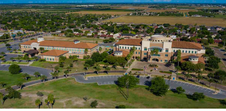
UTRGV Regional Academic Health Center & Medical School