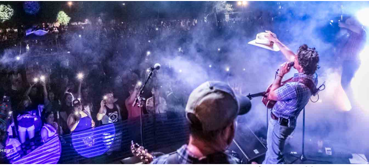
Freedom Fest 2017